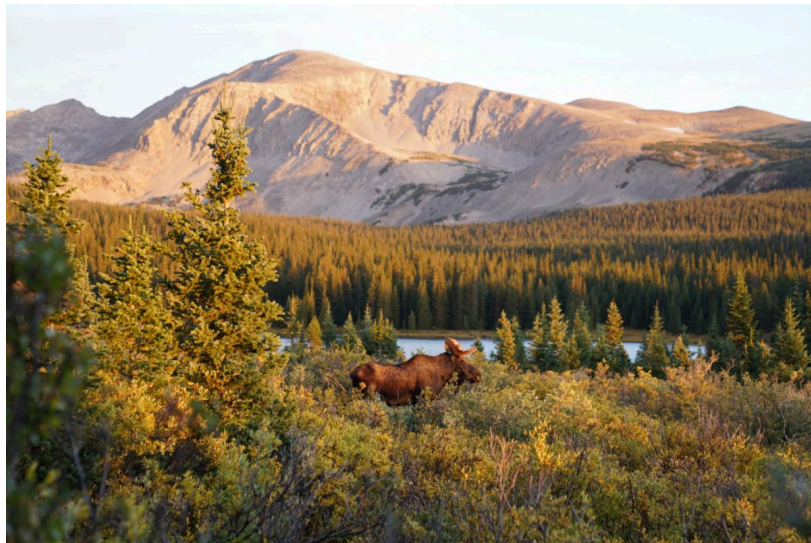
Moose at Sunrise by Kallie Bjerke (2019 IPWA Photo Contest Winner)

Are moose native to the Colorado Rockies? Are they invasive? How should the answers to these questions shape management where moose have degraded wetlands and where moose–human conflict is growing?