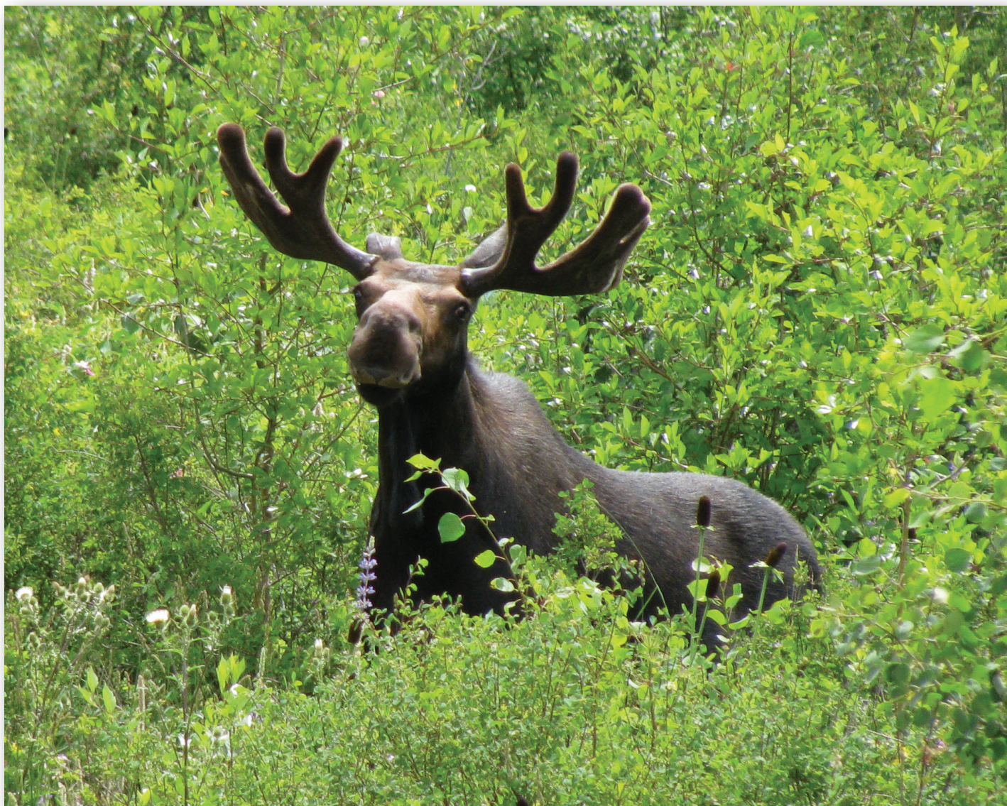
This bull moose is agitated by the presence of people.

Moose are magnificent creatures and are exciting to see but they can be very dangerous if you or your dog get too close.